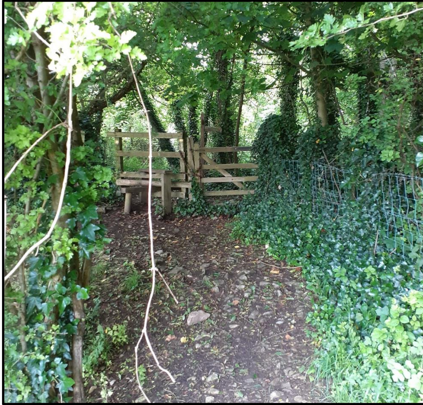
Photograph 7, east of F1, looking west