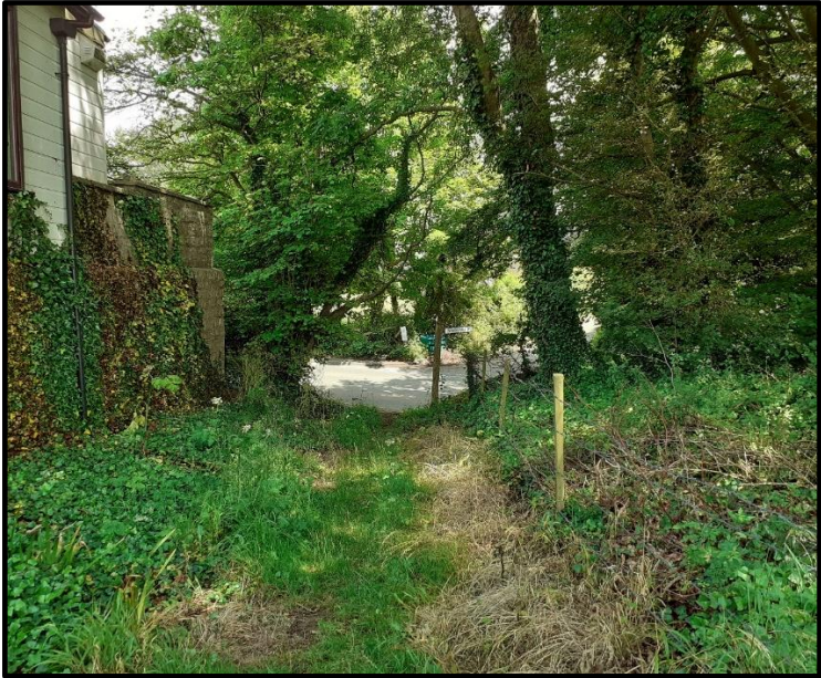
Photograph 17, between G and G1, looking east