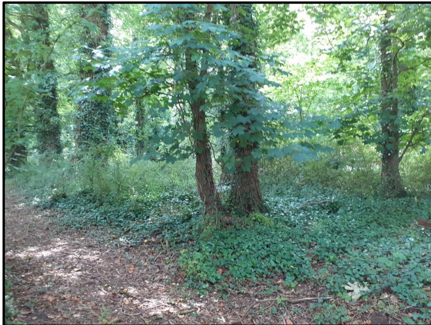
Photograph 4, between F and F1, looking towards the western boundary