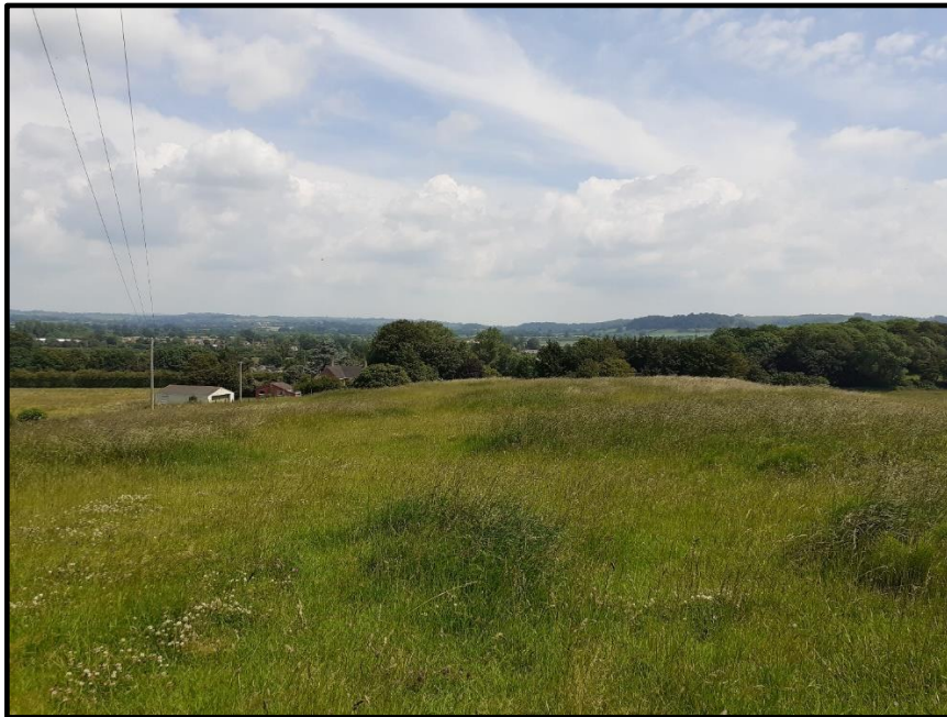
Photograph 10, between G2 and G3, looking east