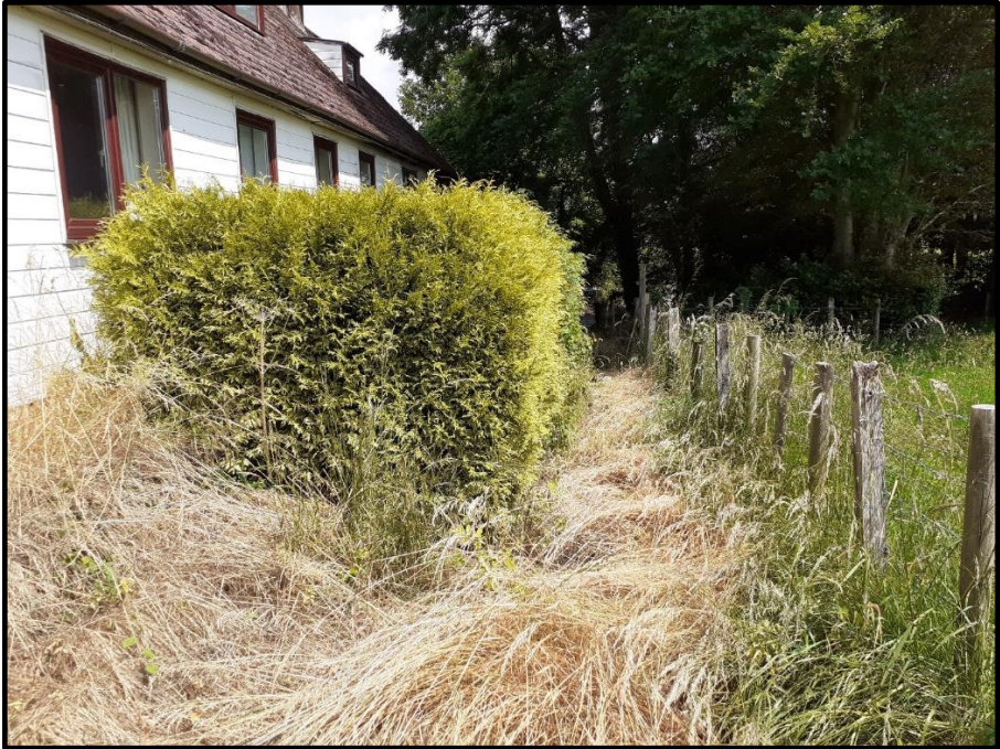
Photograph 14, between G and G1, looking east