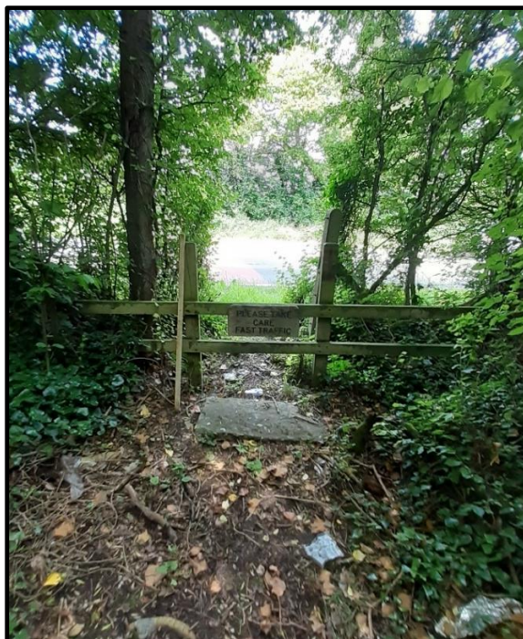
Photograph 2, facing north looking at point F