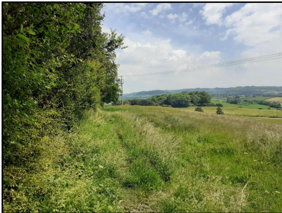
Photograph 8, between F1 and G3, looking east