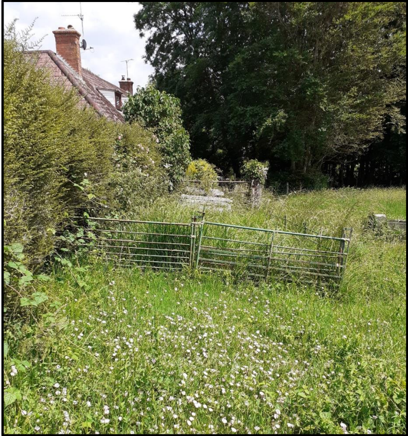
Photograph 13, between G1 and G2, looking at G1