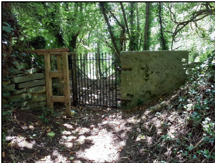
Photograph 6, north of F1, looking south