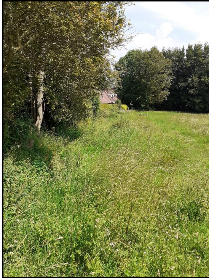
Photograph 11, between G1 and G2, looking east