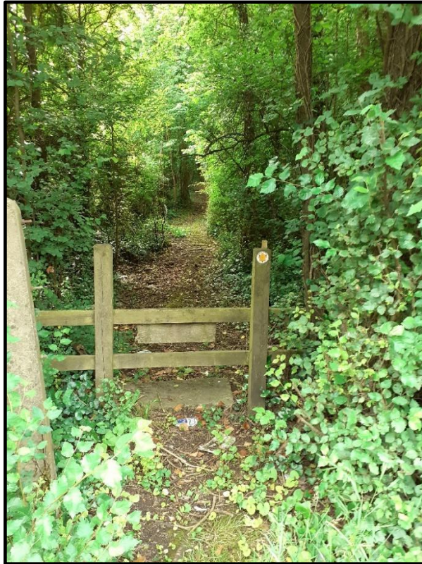
Photograph 1, at point F looking towards F1