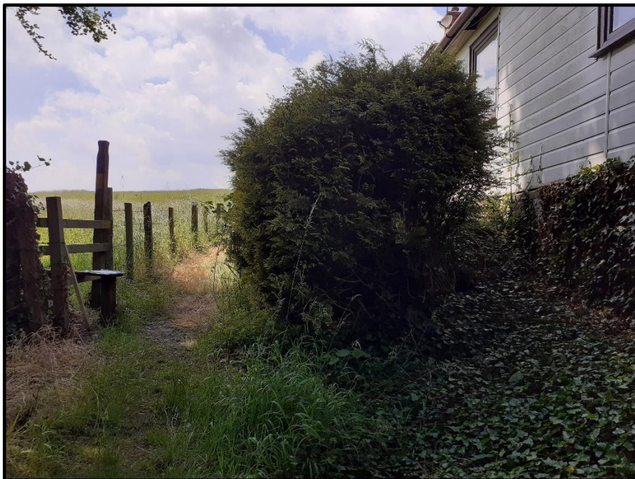
Photograph 16, between G and G1, looking west