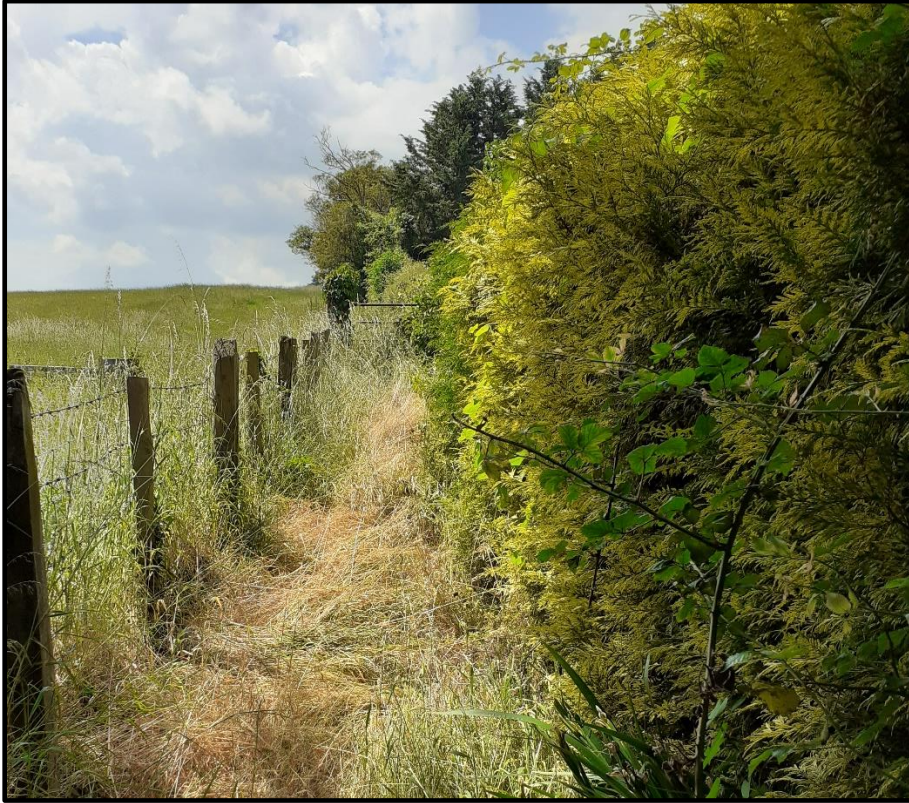
Photograph 15, between G and G1, looking at G1