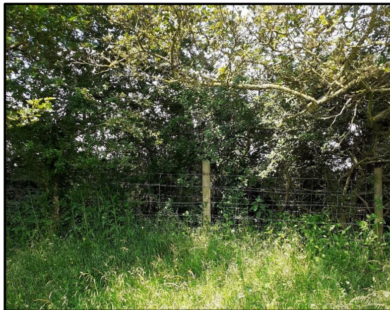
Photograph 12, between G1 and G2, looking towards the northern boundary