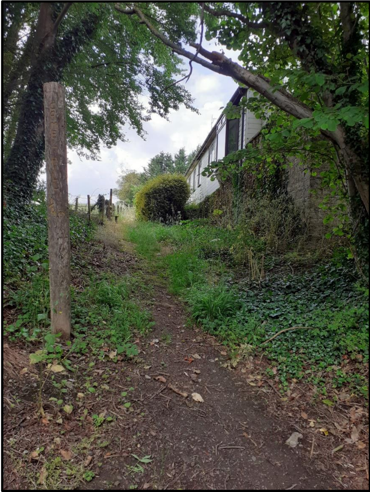
Photograph 18, at G, looking west