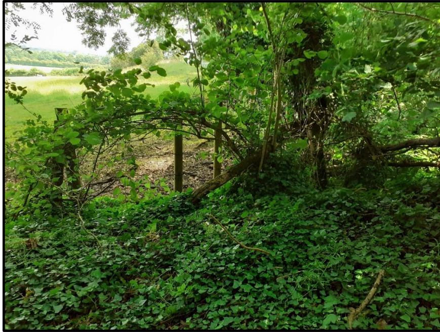
Photograph 5, between F and F1, looking towards the eastern boundary