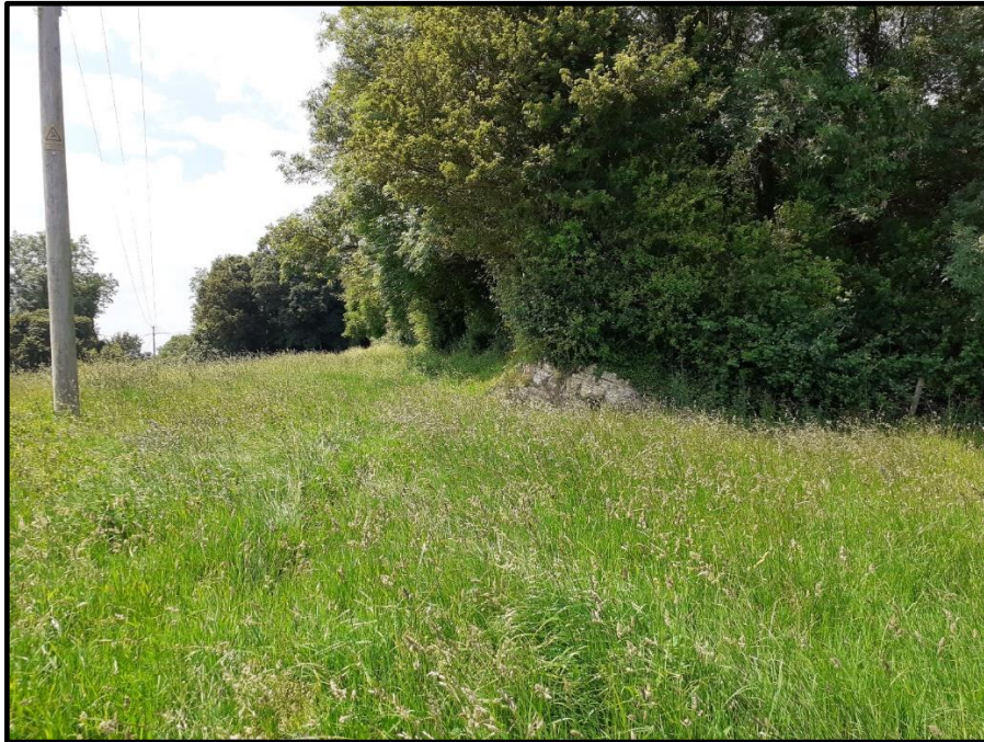
Photograph 9, between G2 and G3, looking west